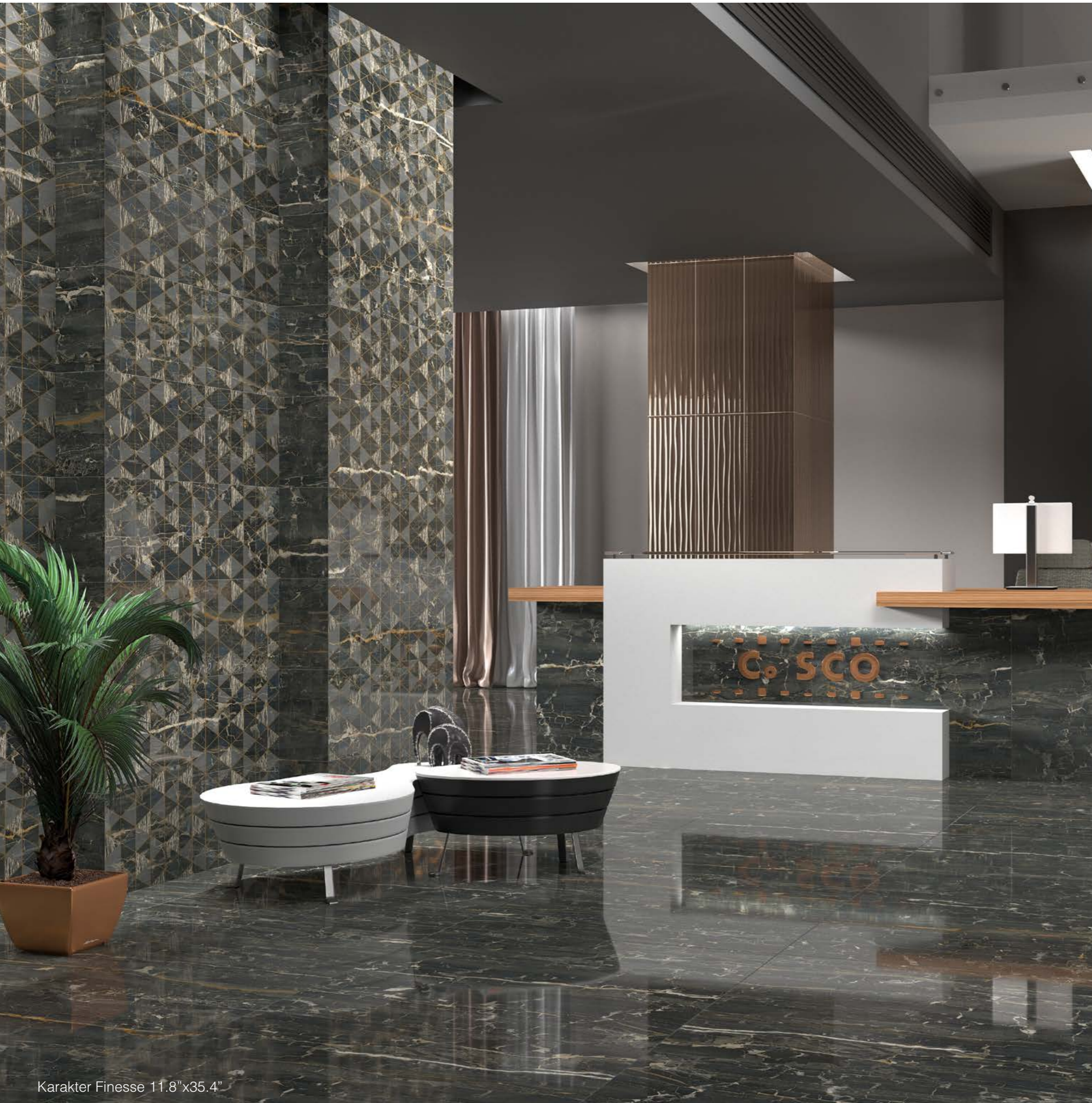
Karakter Finesse 11.8"x35.4"

Leonardo, a collection based on the visual effect of natural stone, inspired by a penchant for the dramatic. A set of black and white tiles with copper-colored veins that show the strength, but also the fragility, of marble. The Leonardo collection blends with copper-colored decorative accessories, which complement its striking veins.